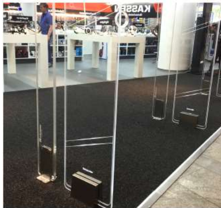
Shopguard Twilight EAS and HyperGuard installation